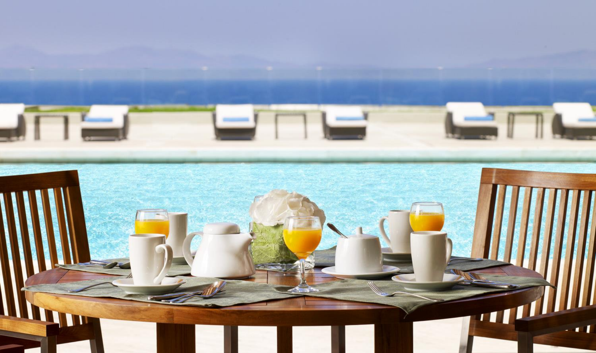
Castellania – Main restaurant