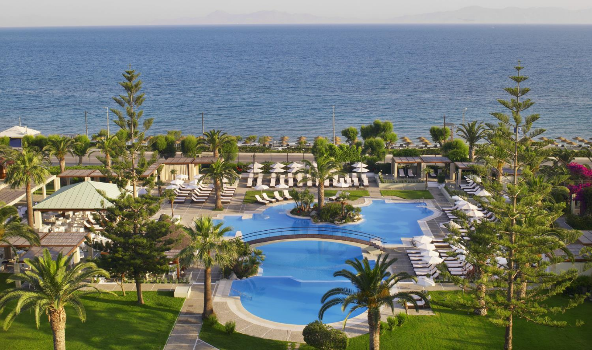
The Main Pool