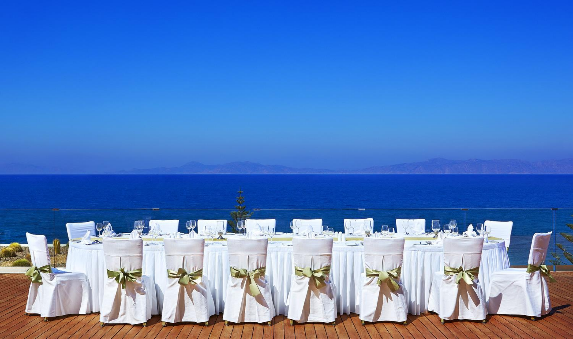
7 th Floor Deck - Banquet