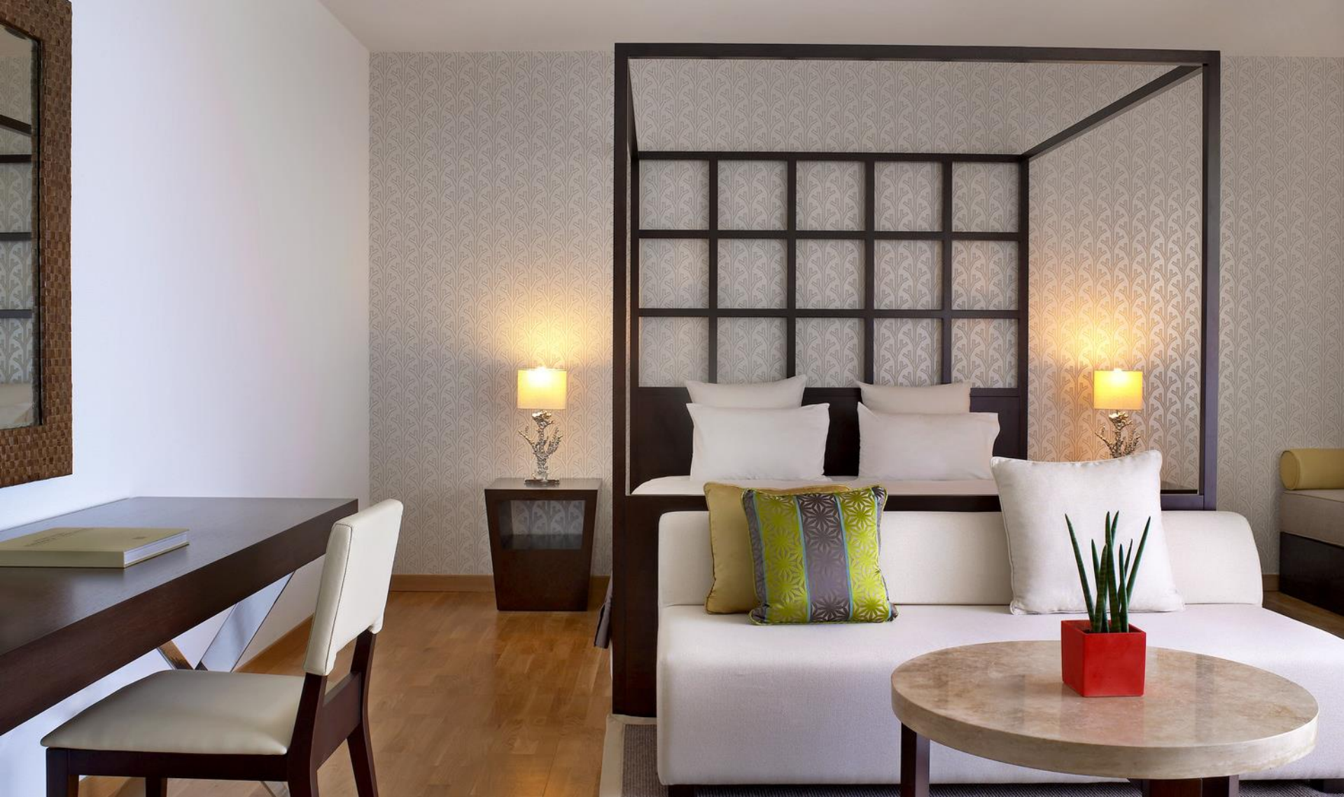
Junior Suite – Sea View