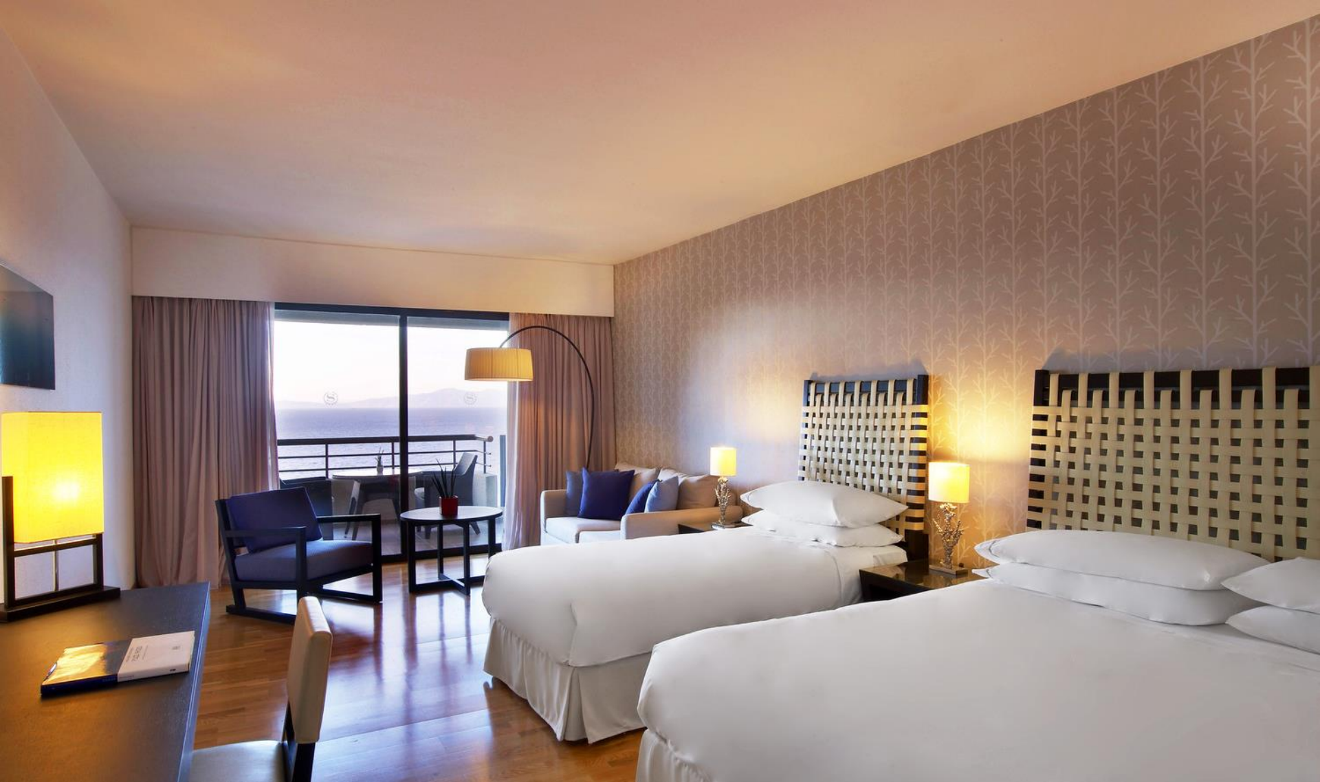
Family Room – Sea View