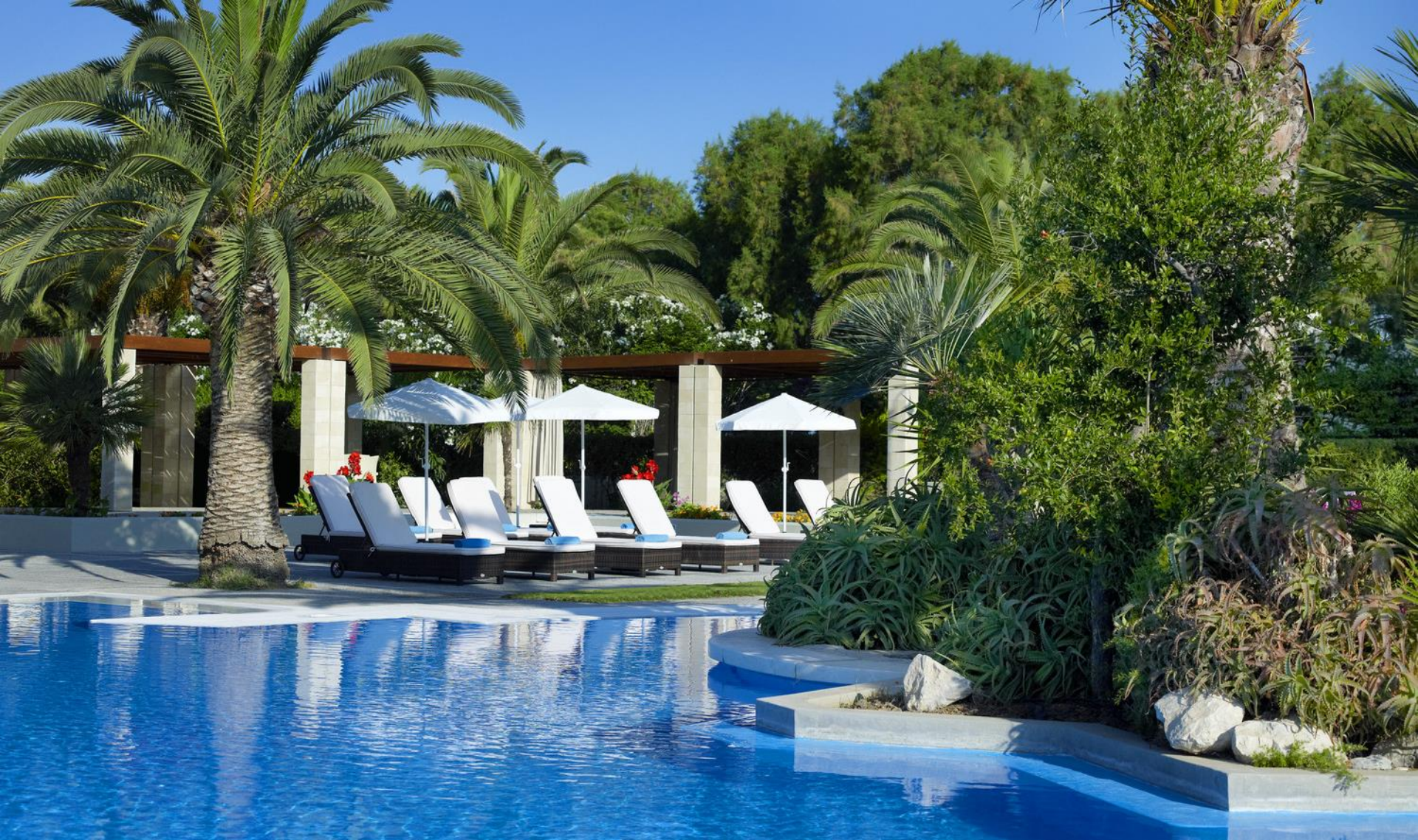
The Main Pool