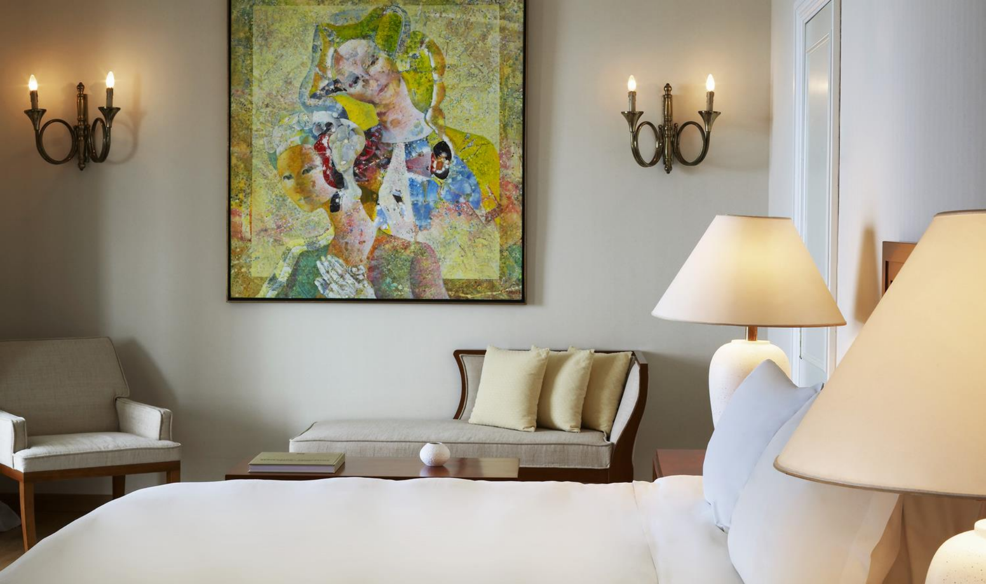
Family Suite Sea View – Master Bedroom