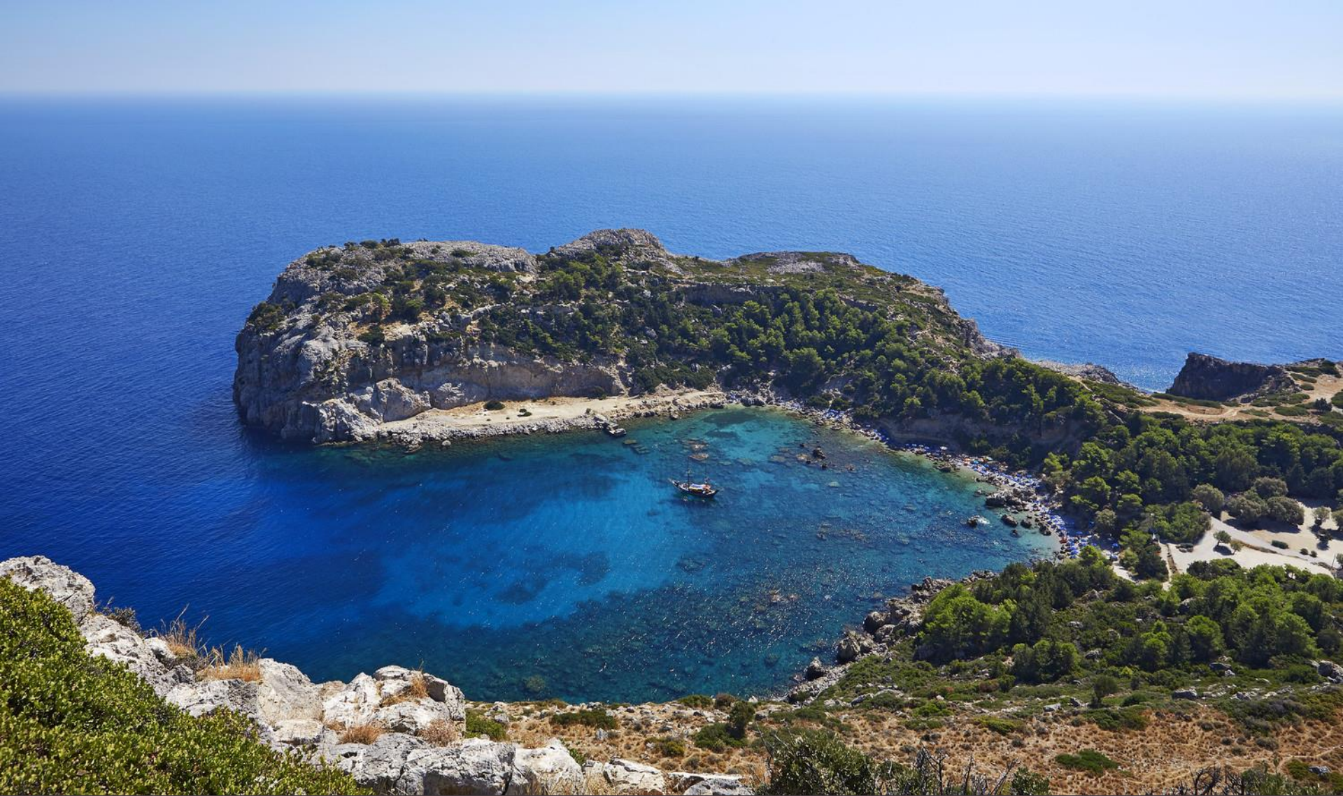
Anthony Quinn Beach