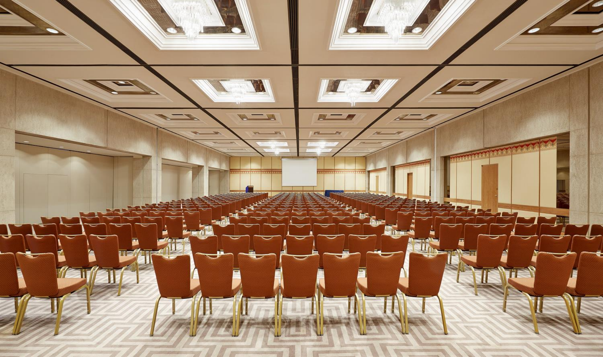
The Imperial Ballroom