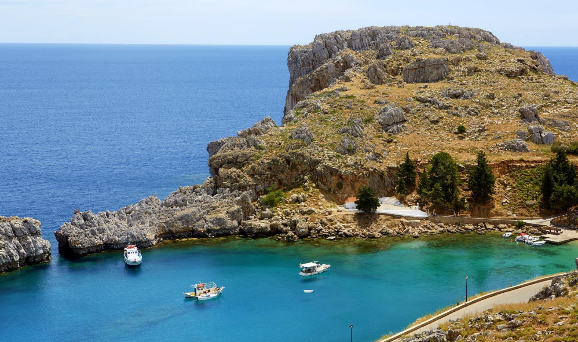
Lindos – Saint Paul's Bay