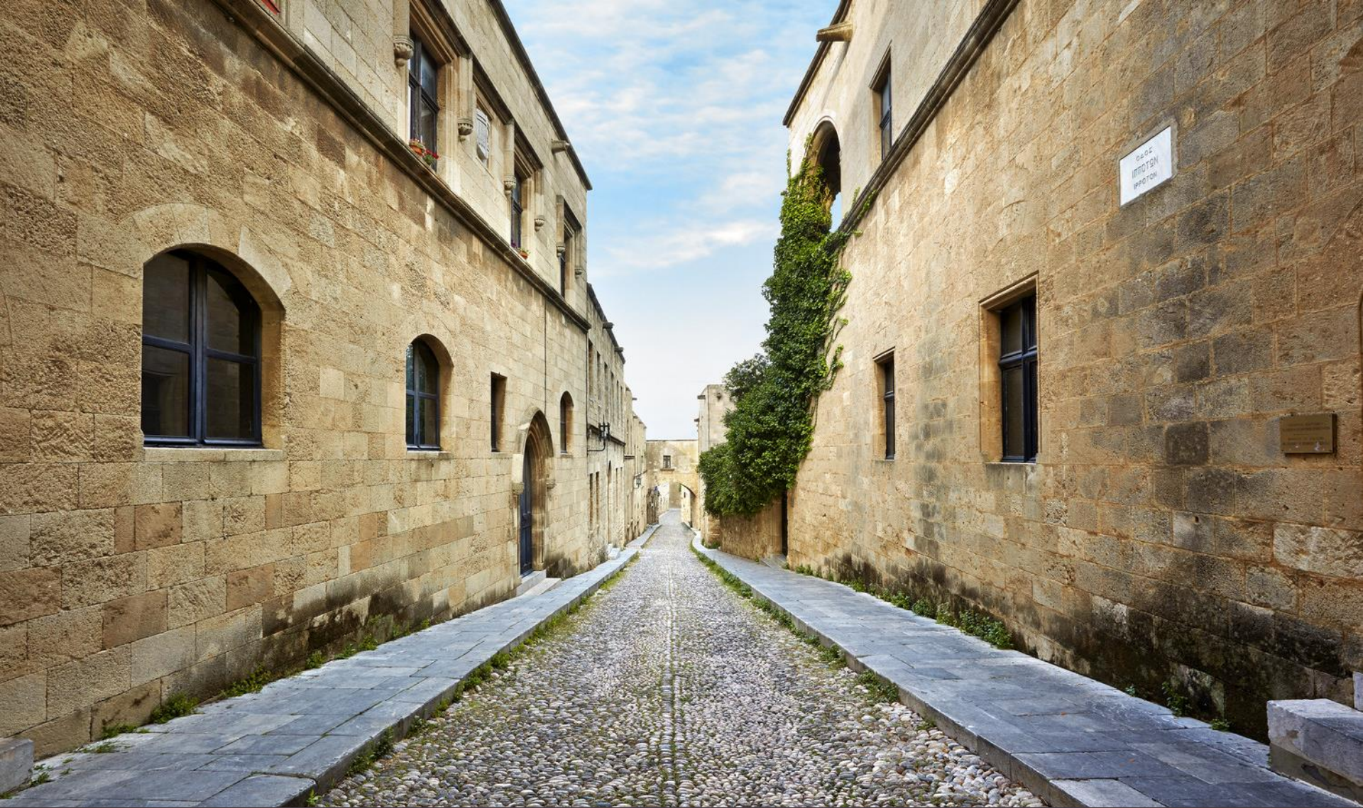
Medieval Town – Street of the Knights