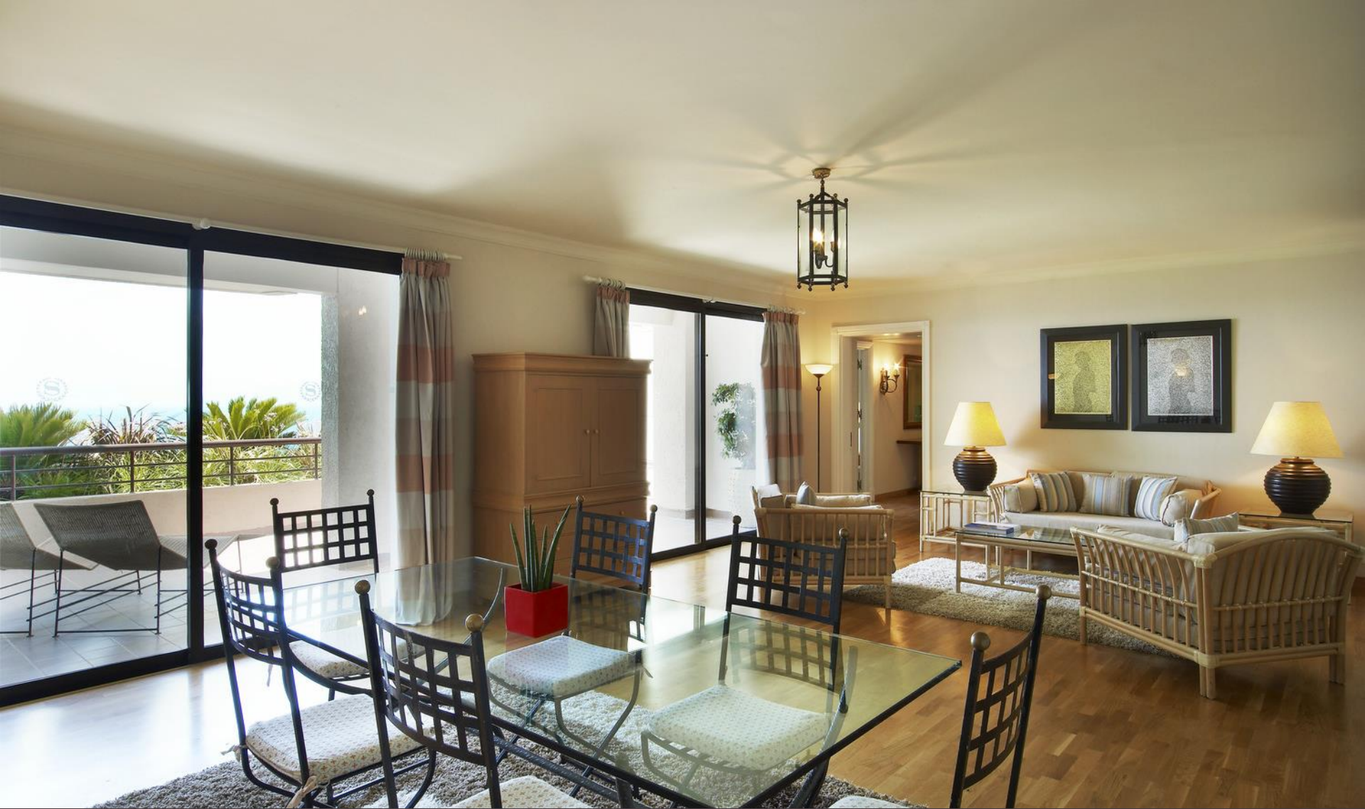
Family Suite Sea View – Living Room