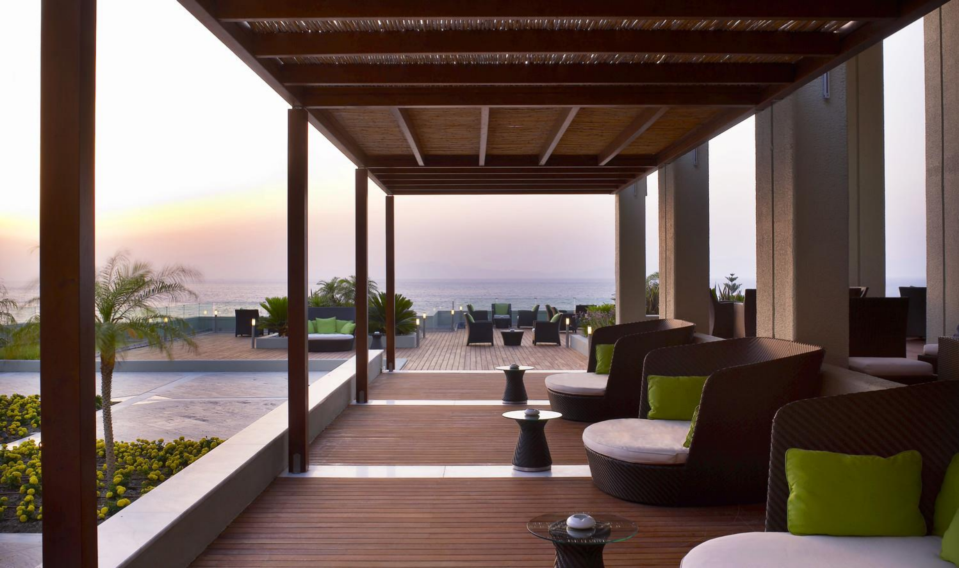
The Lounge Bar