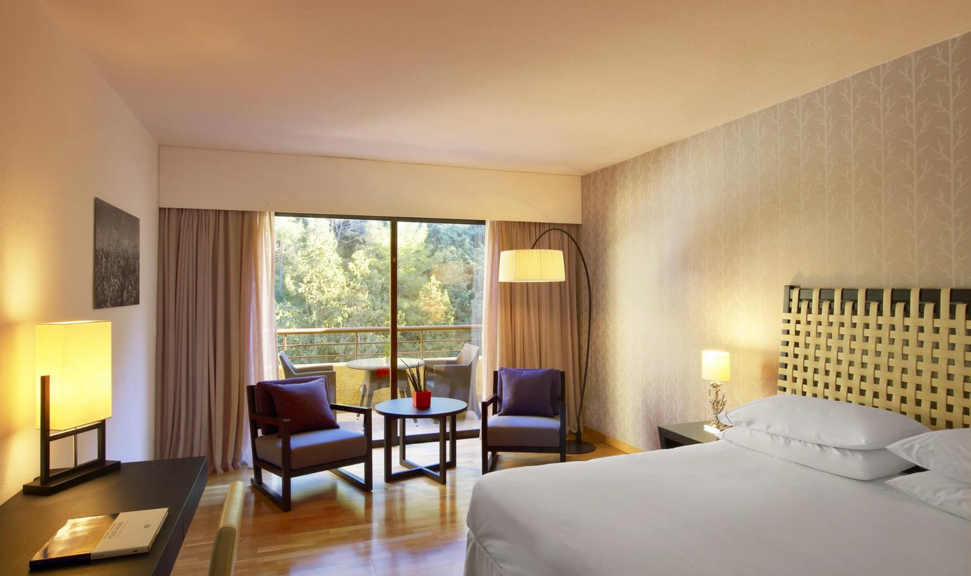
Classic Room – Mountain View