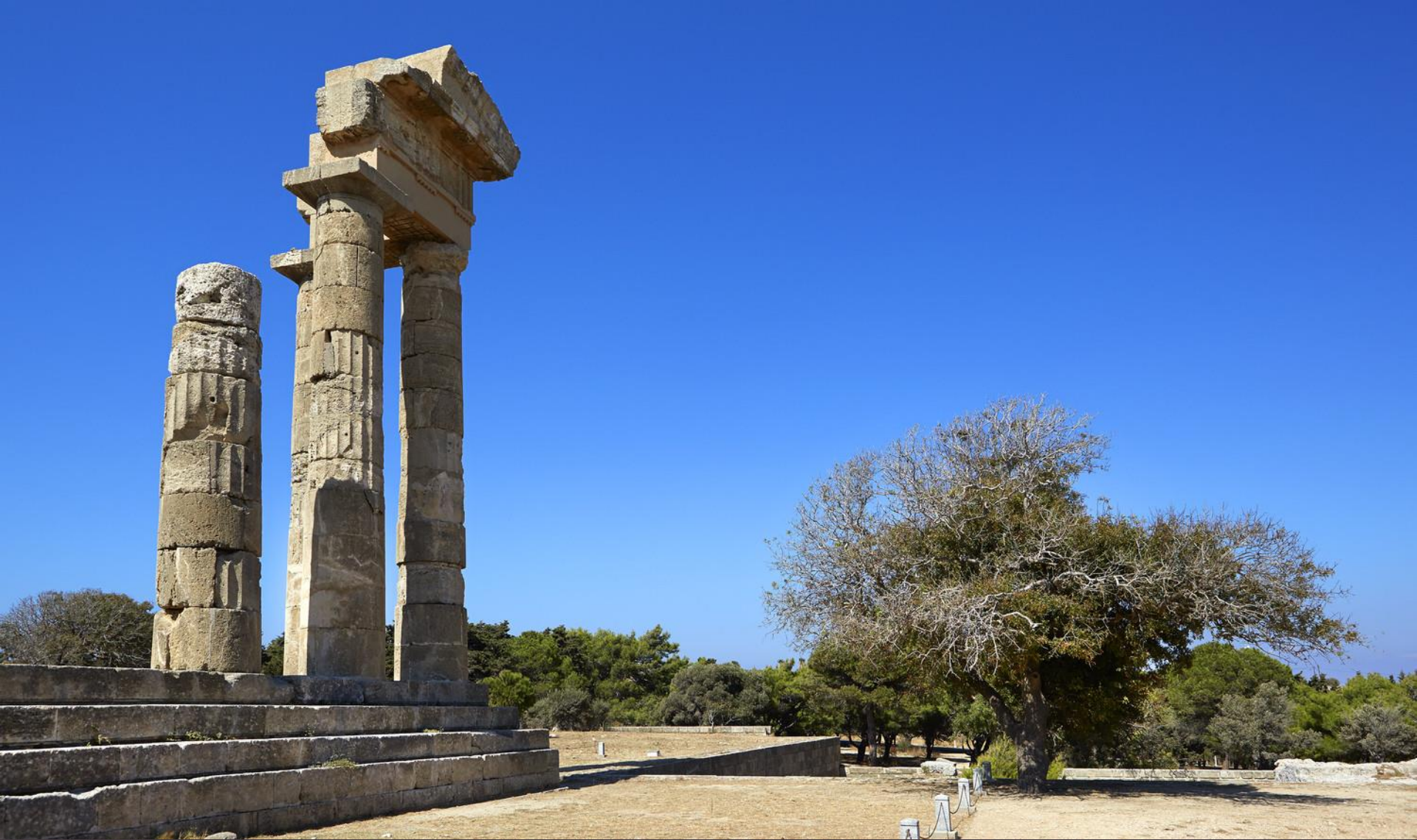
The Acropolis of Rhodes