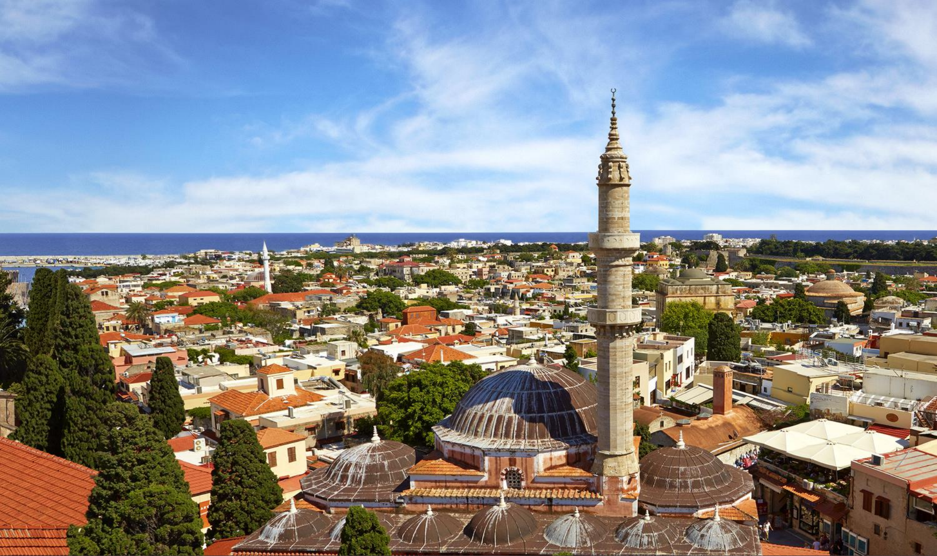
Medieval Town – Panoramic View