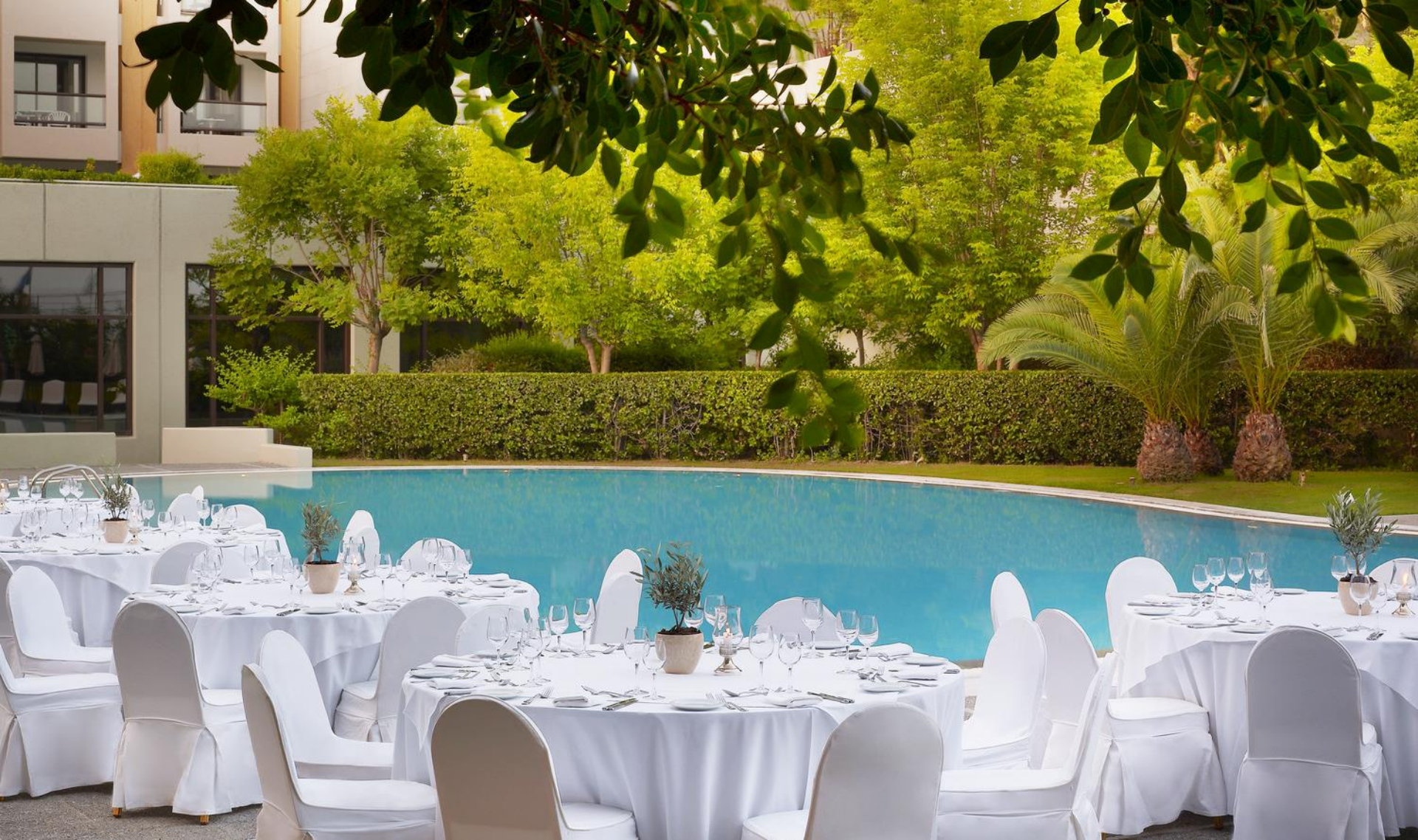
Ground Floor – Poolside Banquet Set-up