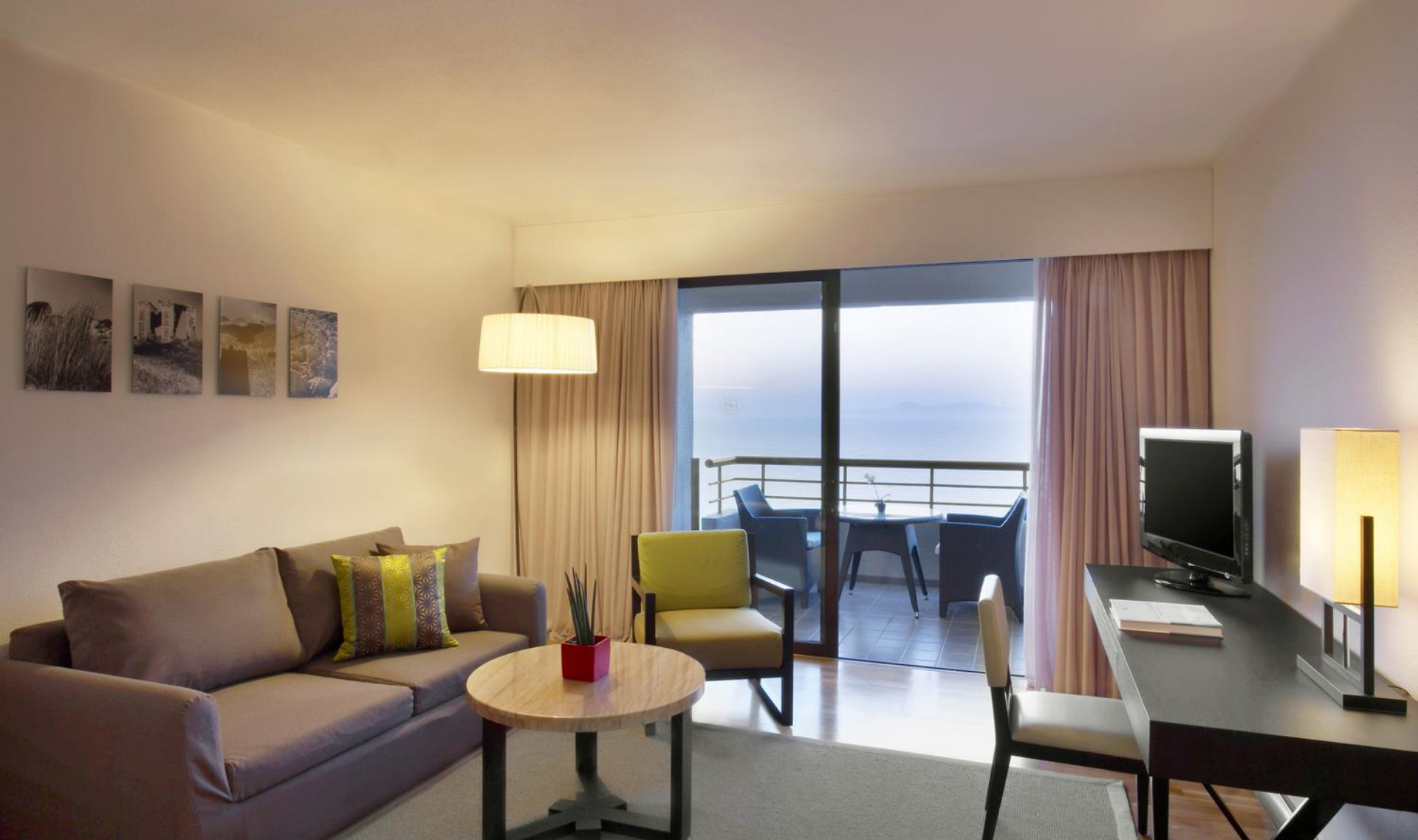
Aegean Suite – Living room