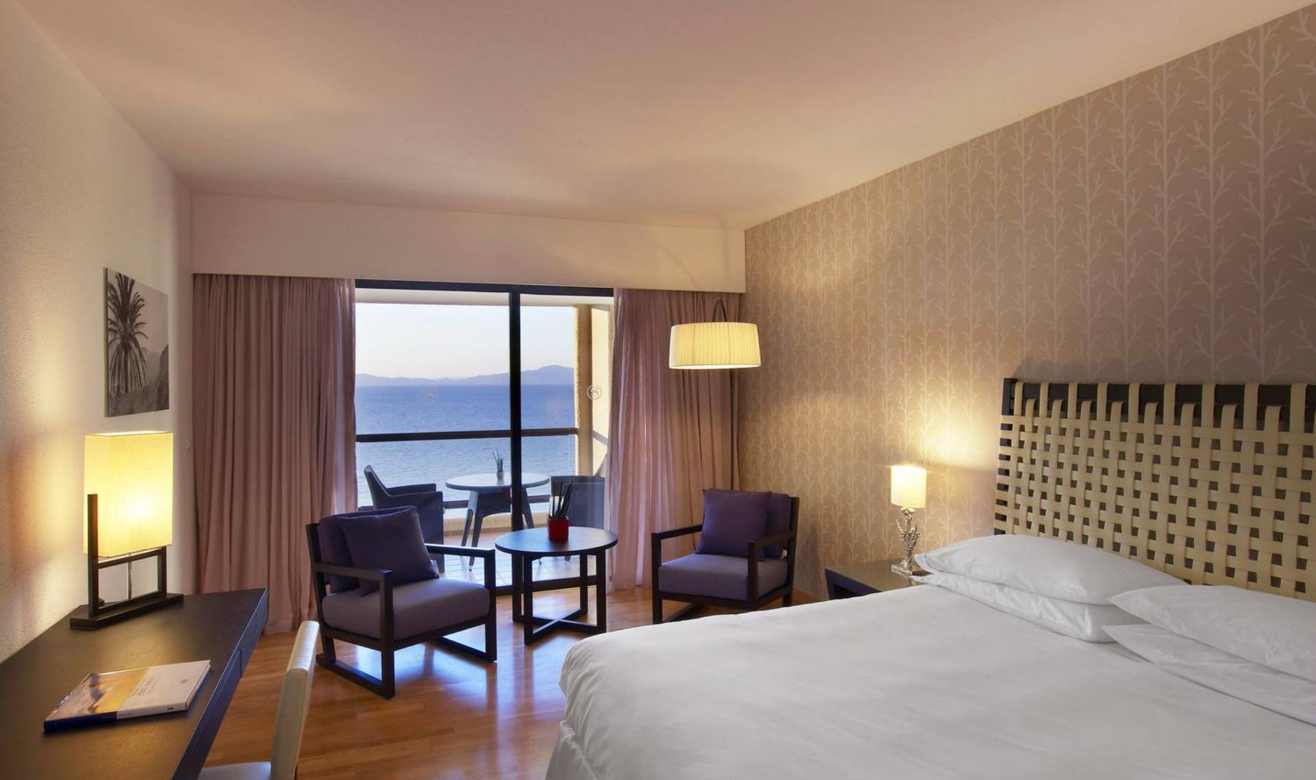
Deluxe Room – Sea View