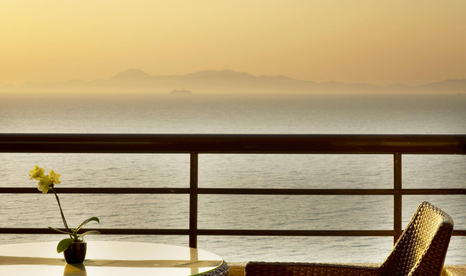
Aegean Suite – Private Balcony View