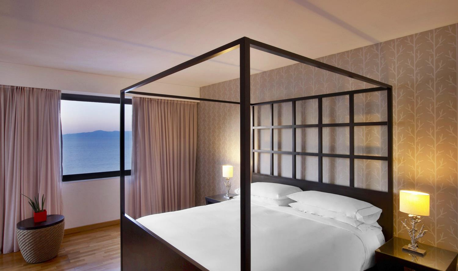
Aegean Suite - Bedroom