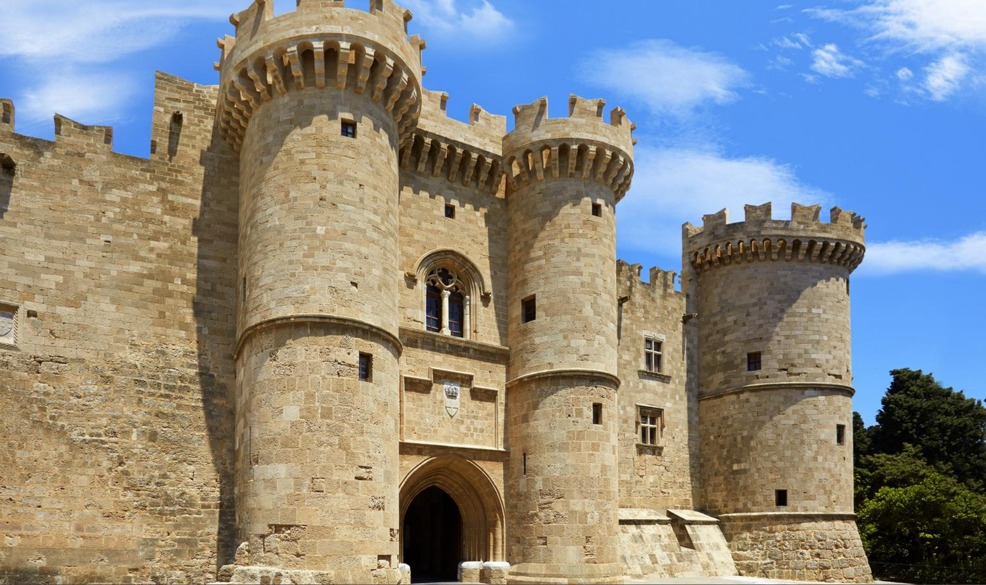
Medieval Town – Palace of the Grand Master