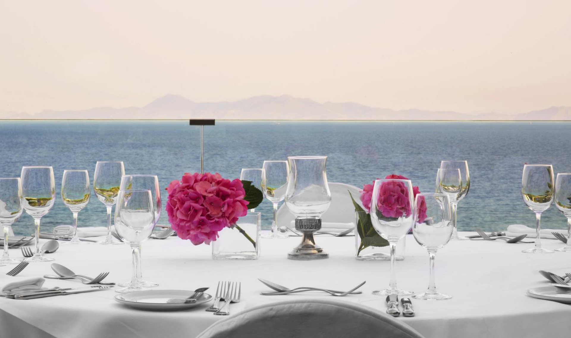
6 th Floor Deck - Banquet