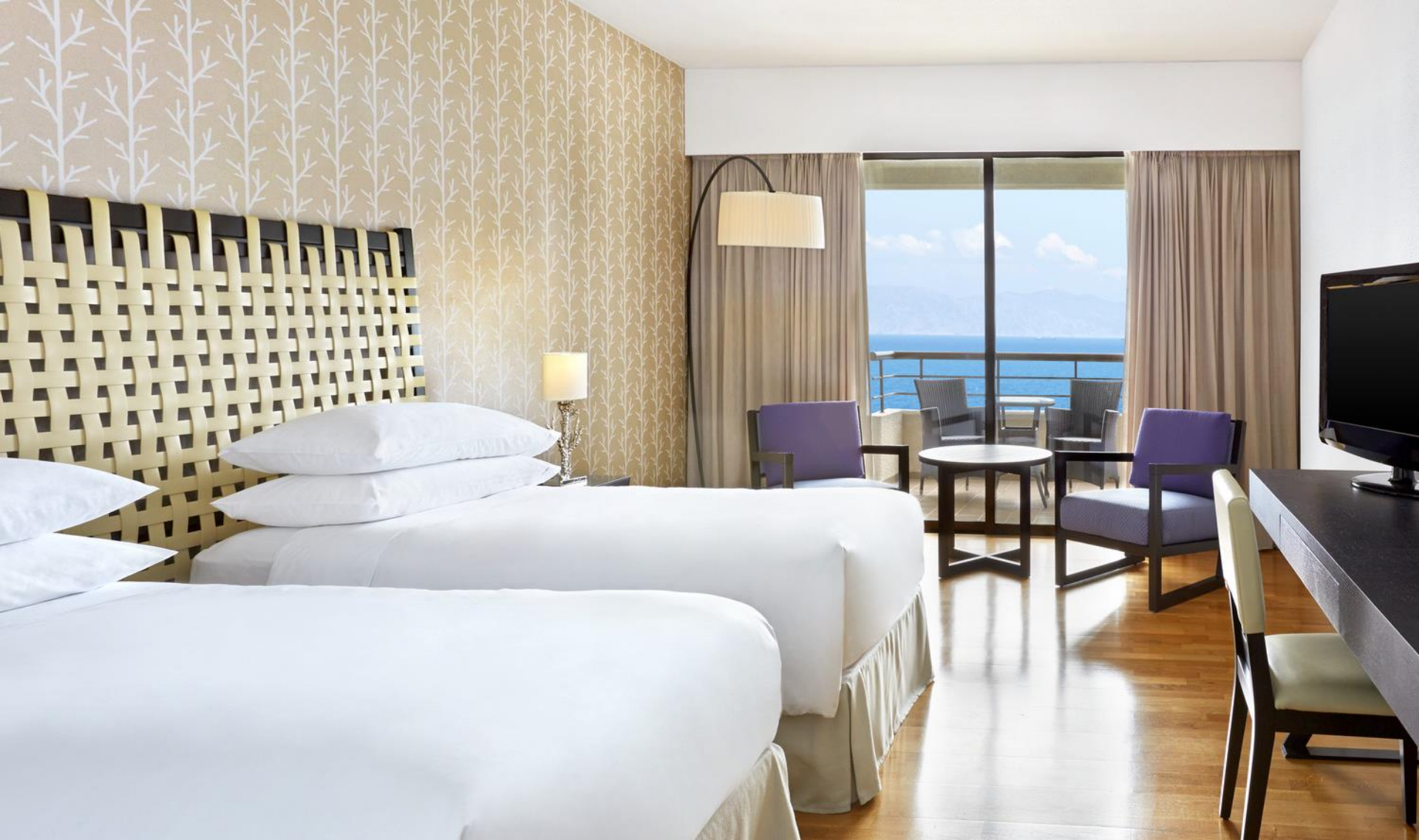
Superior Room – Gardens, Pool and partial Sea View