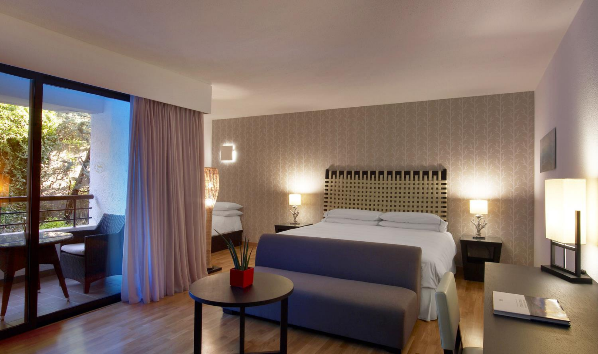
Family Room – Mountain View